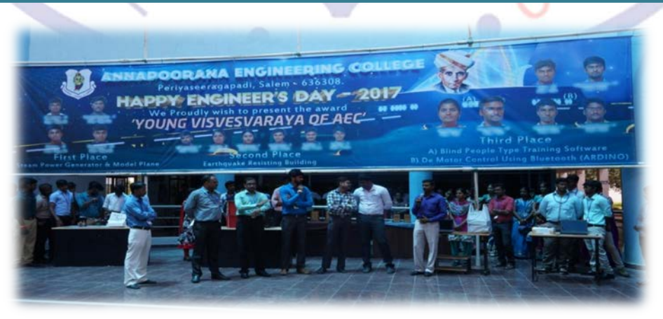
11 Volume: 1, Issue: 1, November 2017, Annapoorana Engineering College

ENGINEER'S DAY CELEBRATION AND ENGINEERING PROJECT DISPLAY - 15.09.2017